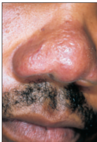
Sarcoidosis of the nose (lupus pernio)