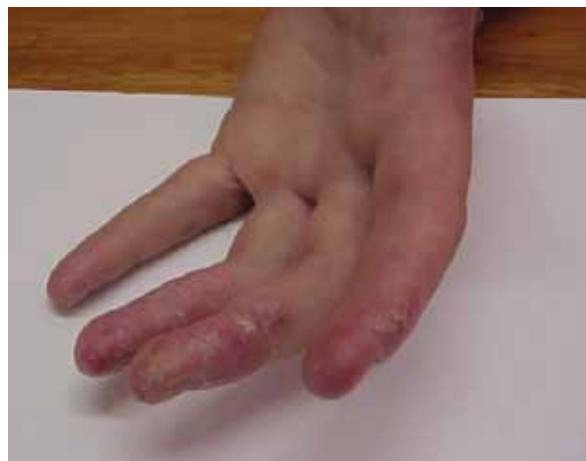
Contact dermatitis from epoxy resin exposure.