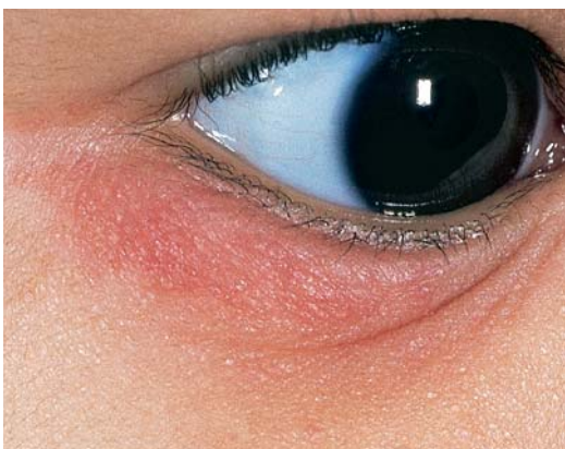
Fig. 2. Lower eyelid eczema in a child.

background of atopy and there is a female preponderance. Although atopic dermatitis may occur on both the upper and lower eyelids, involvement of the upper eyelid alone is usually suggestive of atopic dermatitis.