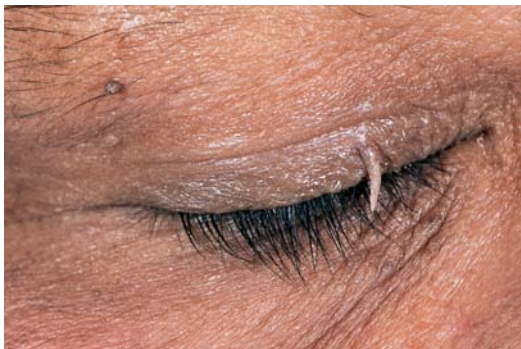
Fig. 8. Cutaneous horn (verruca) in a patient with eyelid eczema.

steroids (even the mild agents that do not contain 1% hydrocortisone) for eyelid dermatitis because of the danger of side-effects such as atrophy, bruising and peri-orbital and acneform rash. Long-term steroid use may also result in dependency and tachyphylaxis. Cessation of the topical steroid may lead to regular rebound. Systemic antihistamines such as hydroxyzine (Aterax) may alleviate the pruritus. The above-mentioned treatment is required for acute eyelid dermatitis, whatever the cause, including atopic dermatitis (where one may get sudden flare-ups), allergic contact dermatitis or irritant dermatitis.