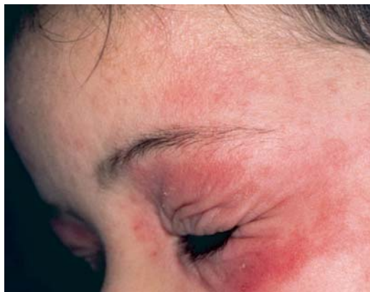
Fig. 1. Childhood eyelid atopic eczema involving the upper and lower eyelid.

Although eyelid dermatitis is common in atopic patients, one needs to exclude allergic and irritant contact dermatitis by history, clinical examination and patch testing. Most eyelid dermatitis occurs against a