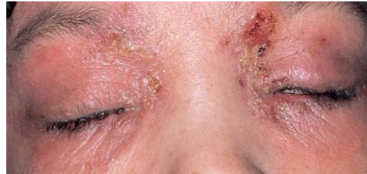
Fig. 4. Eyelid eczema with secondary impetiginisation.