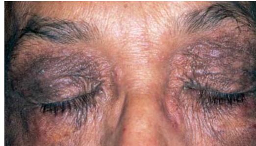
Fig. 3. Chronic lichenified eczema.

The aim of treatment is to decrease the trigger factors and pruritus, suppress inflammation and lubricate the eyelid skin. Acute exudative eyelid dermatitis may be treated with cool compressors or ice packs four times