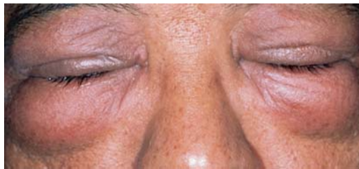
Fig. 5. Contact dermatitis of the eyelid presenting as periorbital oedema.